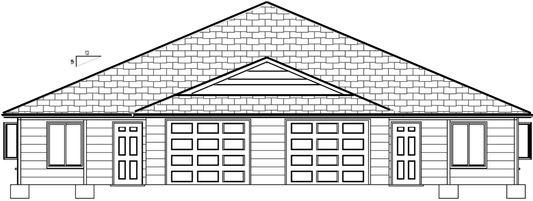
DUTCH GABLE FRONT ELEVATION ELEVATION ONE