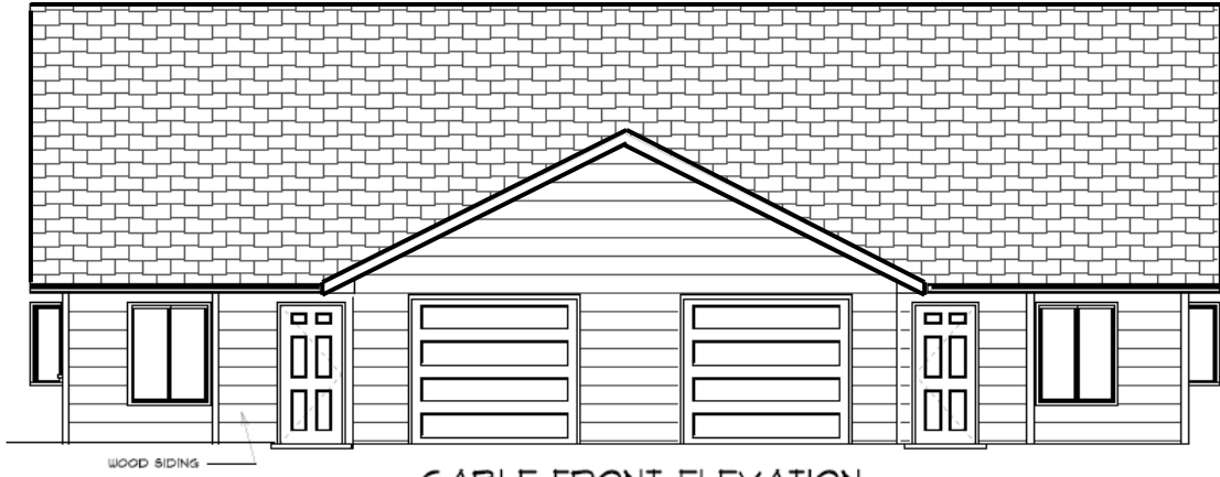
GABLE FRONT ELEVATION ELEVATION THREE